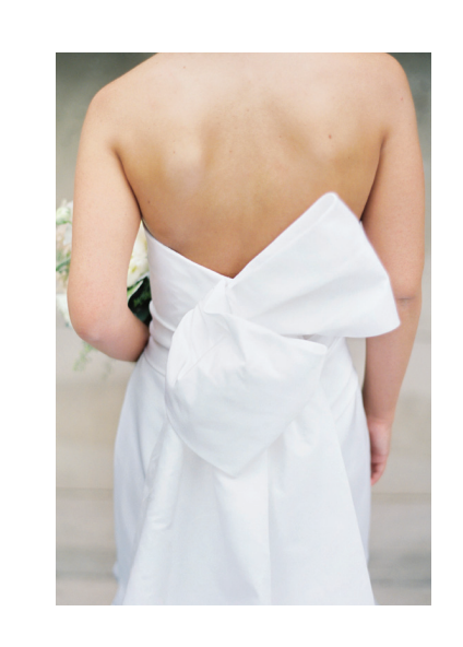
"IT WAS REALLY SPECIAL for us. We took in every moment."

At that moment, though there were 200 friends and family members in attendance that night, it was as if they were the only two people there. D